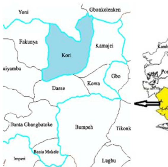
Figure 1. Map of Kamajei chiefdom, Moyamba district, South of Sierra Leone.

population of 50,950 [13]. The Chiefdoms capital is Buedu. The name "Buedu" is derived from the word meaning an area of rich soil for farming and other agricultural services. Kissi Tongi Chiefdom was once the only chiefdom for all the Kissi area/territory. According to the history of Kissi people, Kailondo, who founded the town of Kailahun, now headquarters of Luawa Chiefdom was once the chief/warrior for the Kissi land. Kailondo ruled Kissi land/chiefdom for many years. In the history of Sierra Leone, Kailondo has been mentioned as one of greatest warriors of all time. Those who have written the history of Sierra Leone said a lot about the great warrior Kailondo when he fought and defeated another warrior, N'dawa. Through the greatness of Kailondo, more land was acquired when he defeated those warriors from the Liberian side. Buedu has been one of the border towns between Sierra Leone and Liberia. Buedu has a central market on Fridays, where people from both Liberia and Sierra Leone meet to transact business.